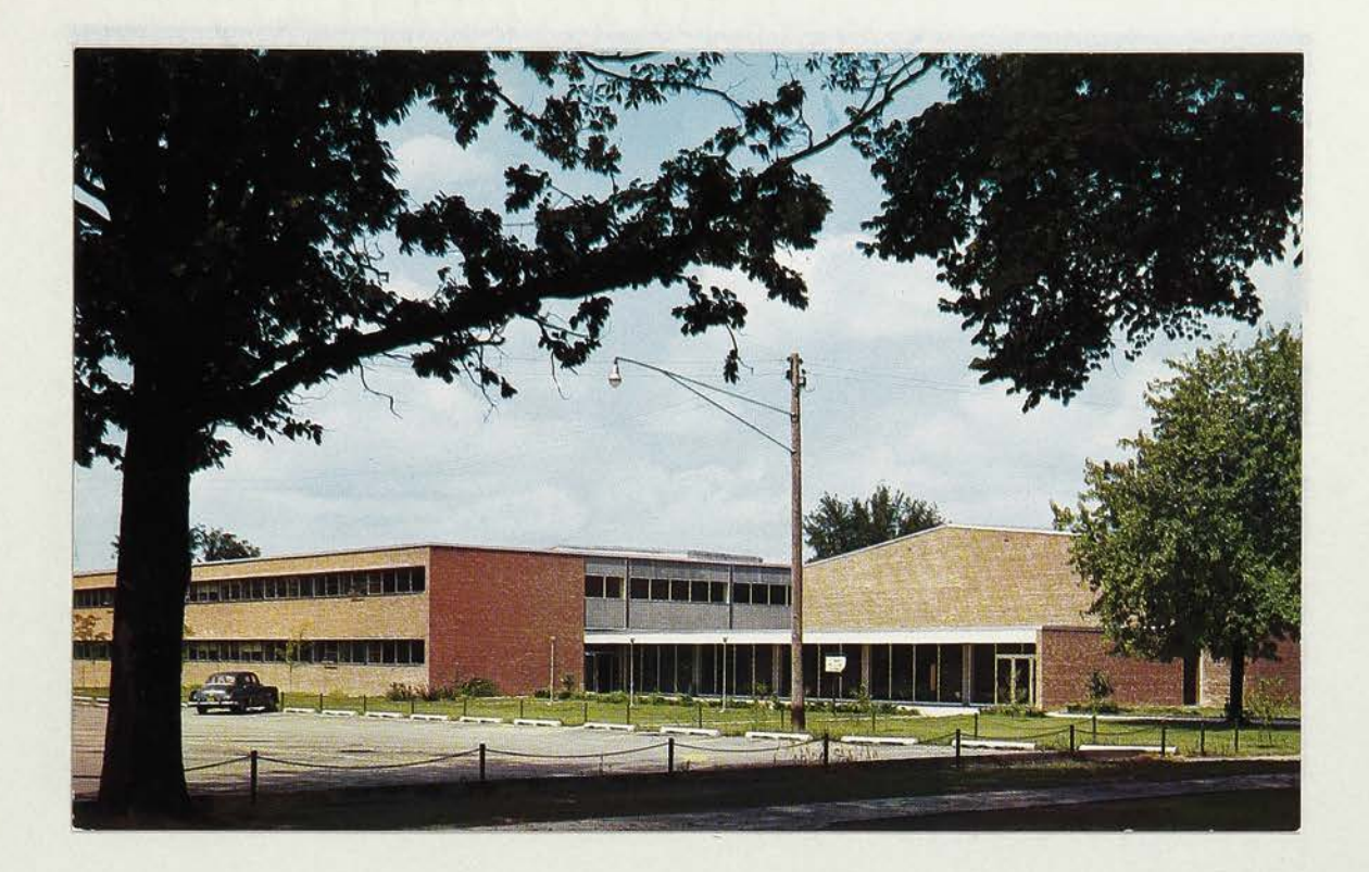
Strong Physical Science Building

This structure has a unique feature of being one of the most economically built facilities, per square foot, of any college building in the country. It houses the Departments of Physics, Chemistry, Mathematics, and Geography.