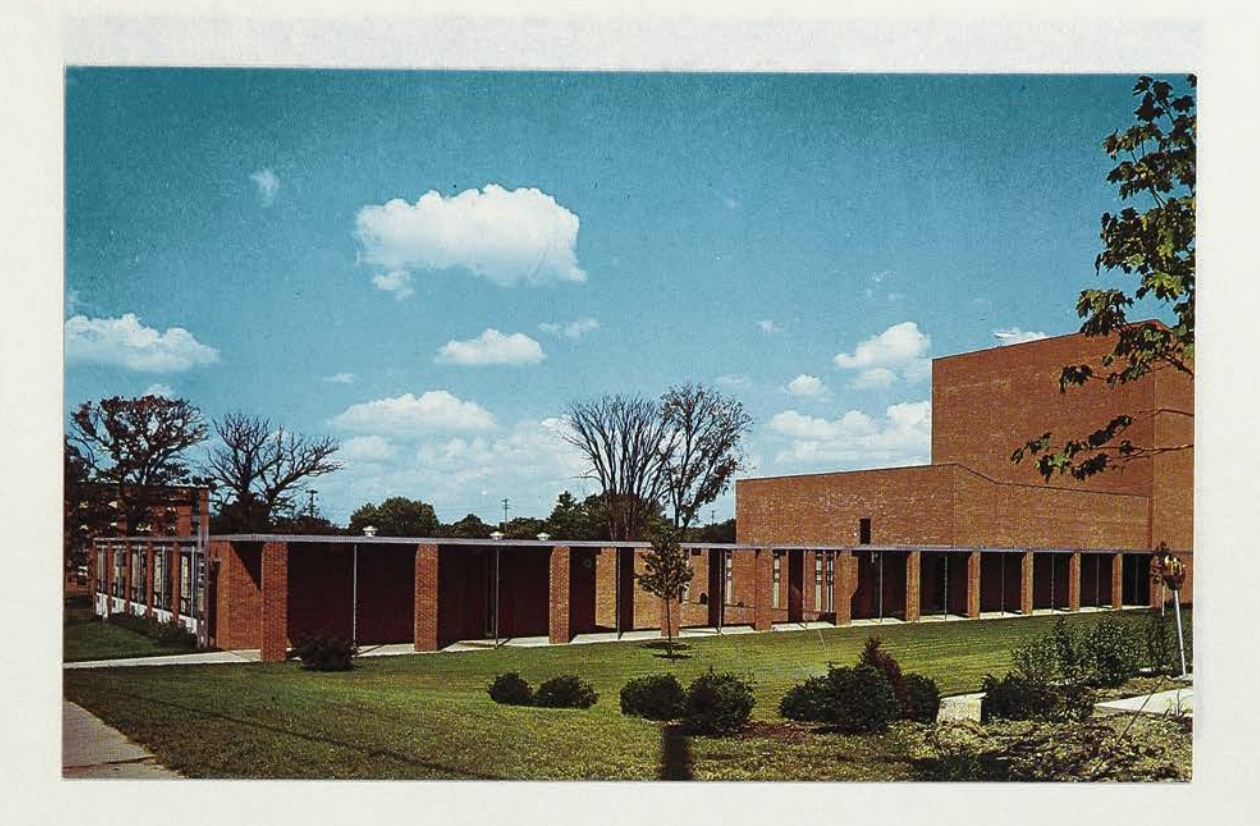
Daniel L. Quirk Dramatic Arts Building

This building, dedicated in January, 1959, contains an instructional theater seating 381. It is also equipped with radio facilities, an outdoor amphitheater, and classrooms and offices housing dramatic and speech activities. The University FM radio station, WHUR, has broadcast facilities in this building.