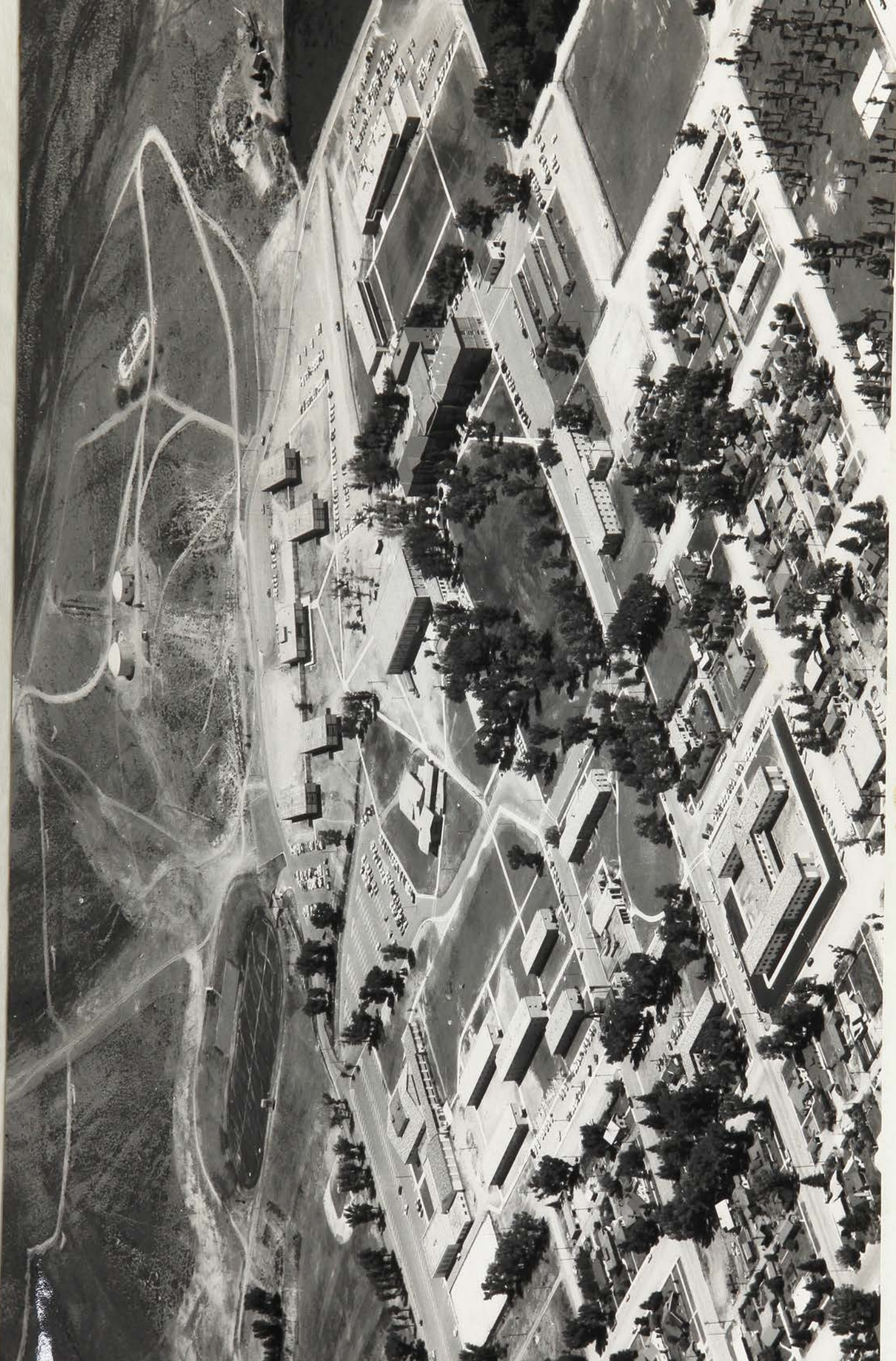
AERIAL VIEW OF CAMPUS